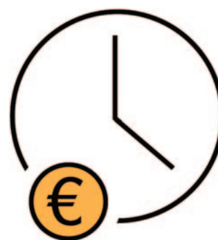
Provide and save resources